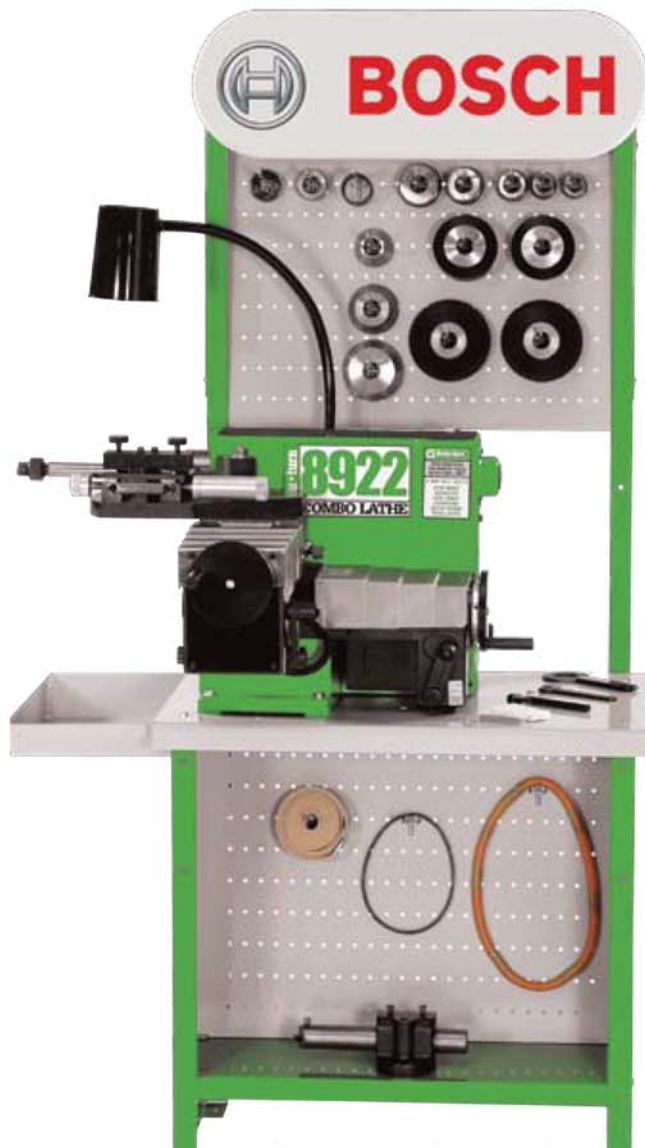
Shown on optional 8939 Bench with 8010 adapter group