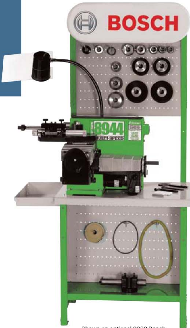
Shown on optional 8939 Bench with 8010 adapter group