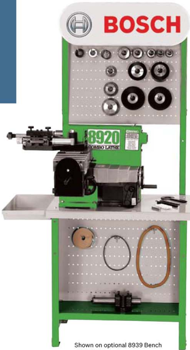
Shown on optional 8939 Bench with 8010 adapter group